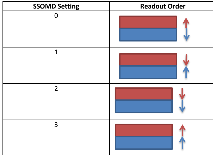
Table 12 Available Sensor Readout Modes

Example: Set readout to be from center out.